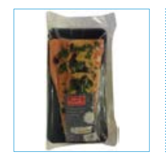
WAITROSE CHRISTMAS CLEMENTINE AND CRANBERRY SIDE OF SALMON: is a Scottish salmon filet decorated with clementine, cranberries and orange zest. UK

MARKS & SPENCER CHOCO-LATE & CLEMENTINE CREAM LIQUEUR: is a blend of alcohol, dairy cream and flavorings and is described as delicious. Ireland