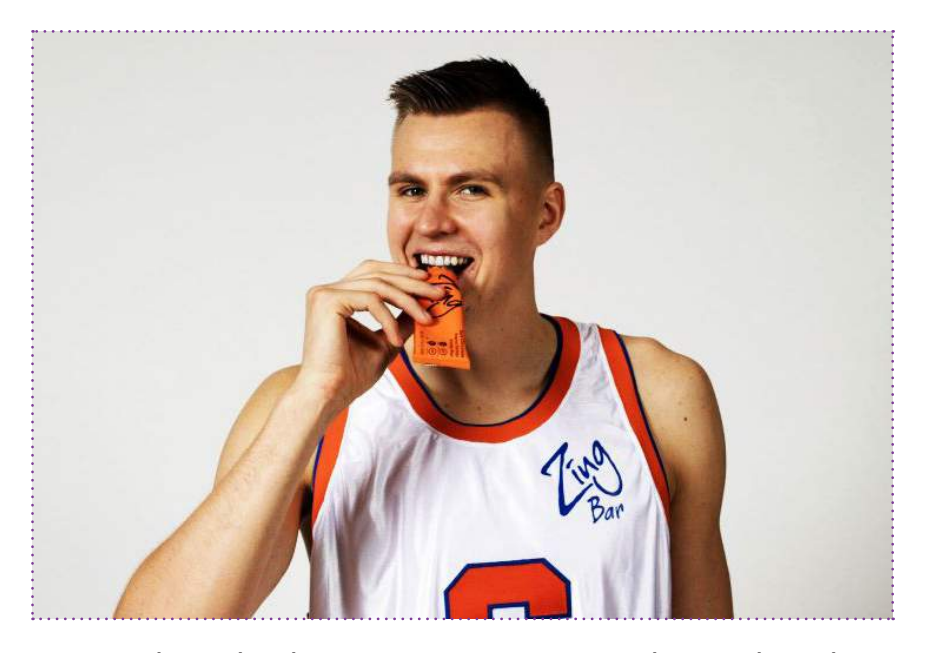
New York Knicks player Kristaps Porzingis is the new brand ambassador for vegan snack bar Zing.