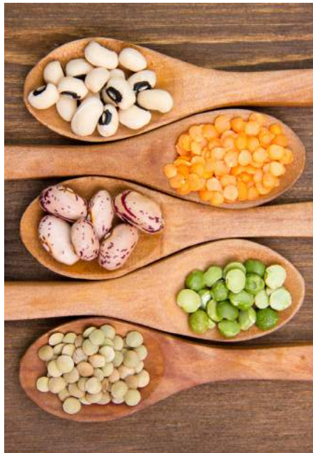
TOP TEN PULSES USED IN GLOBAL LAUNCHES OF FOOD AND DRINK PRODUCTS, 2013-2015

A category comprising dried legumes like peas, beans, chickpeas and lentils; pulses are revered for their high plant protein content, low glycemic index, and high fiber profiles. With 2016 deemed the Year of the Pulse by the United Nations, these little darlings of both nutritionists and health-conscious consumers have more than a steady pulse when it comes to popularity. Case in point: the green split pea has sprouted a 126% growth in new food and drink products between 2014 and 2015. 1 Pulses have the potential to boost the nutritional value of processed foods like snacks and breads so loved by consumers all over the world as well as the fiber content in low sugar products.