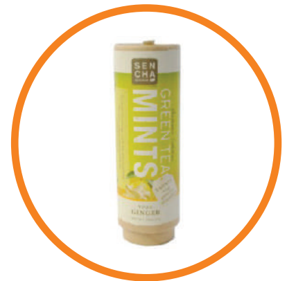
Sencha Naturals Green Tea Mints Yuzu Ginger Mints