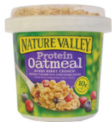
Nature Valley Mixed Berry Crunch Protein Oatmeal contains 10g protein per serving.

One of the Boomers' top concerns regarding their health is their weight. Sixty eight percent of Boomers are worried about their weight. 16 This creates an opportunity for manufacturers to create more concepts specific to this market across all dayparts.