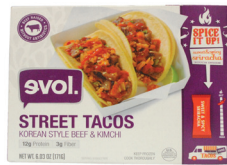
Evol. Street Tacos Korean Style Beef & Kimchi Tacos contain beef raised without antibiotics or hormones. The microwavable and USDA inspected product contains 12g of protein and 3g fiber per serving.