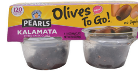
Musco Family Olive Co. Pearls Olives To Go!

It has been found that more than 55% of all consumers eat alone and this doesn't exclude Baby Boomers. Resealable packaging is convenient and allows for multiple uses. Individual use containers also are important for this segment since the Boomers' household is smaller than it used to be. 17