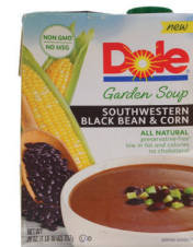
Dole Garden Soup Southwestern Black Bean & Corn Soup

featuring Kalamata Pitted Greek Olives are available in an on-the-go pack with easy-to-open tops.