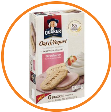
Quaker Oat & Yogurt Strawberry Sandwich Biscuits contain 10g whole grains per serving.

It's clear consumers would appreciate a healthier cookie with great taste. Cookies are the perfect snack size, easily satisfy a sweet tooth and provide the psychological gratification of indulgence. Two-thirds of American consumers consider health attributes when buying cookies, and in order to claim their share of the growing snack market, manufacturers should consider incorporating healthy ingredients such as Greek yogurt.