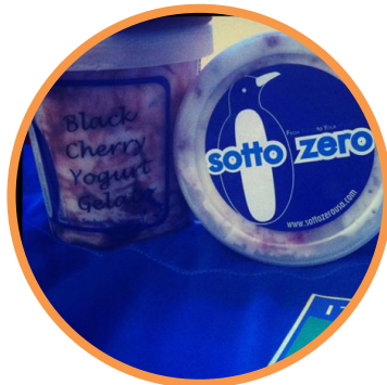
Sotto Zero Black Cherry Yogurt Gelato is handcrafted daily in small batches by third generation ice cream masters from Rome. The manufacturer claims that it is made with local, hormone-free milk and high quality ingredients.