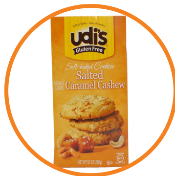
Udi's Gluten Free Salted Caramel Cashew Soft-Baked Cookies

OF COOKIE CONSUMERS WOULD LIKE TO SEE MORE GLUTEN- FREE OPTIONS IN THE COOKIE CATEGORY.