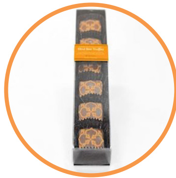
Kilwins Stout Beer Truffle

Lille Belle Farms Limited Edition Whiskey in the Bar Barrel Aged Dark Chocolate has been aged in whiskey barrels, and the charred oak and aged whiskey imparts a flavor that balances the blend of Central and South American beans that go into this chocolate.