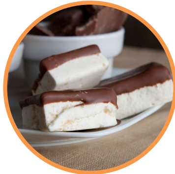
Mallow Artisan Marshmallows Yucatán Flavored Marshmallows has a molten red chili pepper center and a coating of milk chocolate, cocoa powder and other spice.

Despite (and perhaps in part because of) the technology-focused world we live in, consumers crave and respect products made by hand and appreciate a human touch. “Handcrafted,” “made by hand,” and “artisan” are terms used to describe this trend, and its popularity can easily be seen in the sweet snacking arena. Locally made, small batch and handcrafted ice cream products are responsible for the category maintaining its sales as consumers appreciate the premium ingredients and embrace locally sourced concepts.