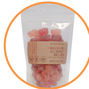
Williams-Sonoma Organic Gummy Bears are free from gelatin, nut and gluten.

Forty one percent of consumers believe that premium sweet snacks are healthier than traditional treats. This is partly due to their perception that premium products contain higher quality ingredients. This belief rings true for 64% for consumers aged 25-34 and provides an opportunity to manufacturers looking to either grow or enter the sweet snacking market as healthier products give consumers permission to snack responsibly. In the chocolate segment especially, line extensions featuring premium ingredients/higher cocoa percentages/flavors will draw consumers who equate premium with better quality.