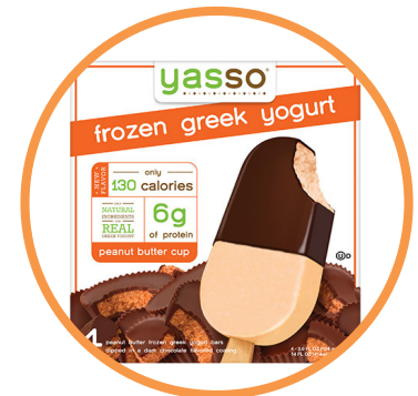
Yasso Peanut Butter Cup Frozen Greek Yogurt Bars contain only natural ingredients, real Greek yogurt, 6g protein and rBST-free milk.