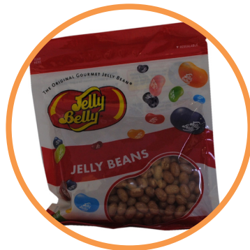
Jelly Belly Draft Beer Jelly Beans